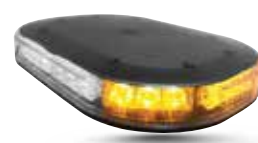
LED Strobe Beacon