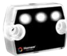
LED Auxiliary Light Front Facing