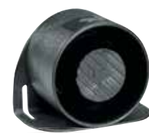
Self-Adjusting 82dB - 107dB 87dB - 112dB