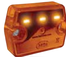
LED Liftgate Flasher