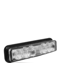
LED Slim Strobe