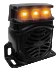
87dB | 97dB | 107dB