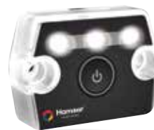
LED Touch Light