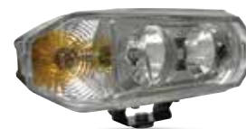
Snow Plow Headlight