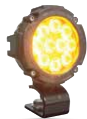
XWL-800 Flashing Amber Warning Light