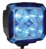
XWL-812 Blue LED Safety Light