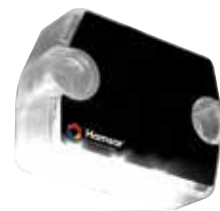
LED Auxiliary Light Down Facing