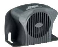
87dB | 97dB | 107dB