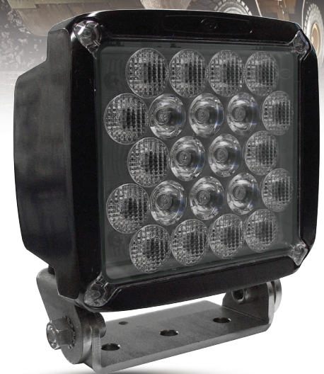
XWL-813 5000 HDM 5000 Lumens 50W

With electronic thermal management & built-in SSF modulation